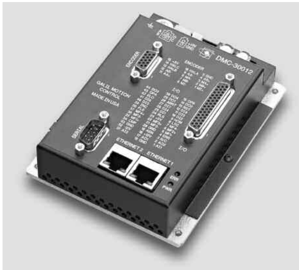
DMC-30012 Single-axis Controller and 800 W Sine Drive

multitasking for concurrent execution of four programs, and uncommitted optically isolated inputs and outputs for synchronizing motion with external events. Modes of motion include point-to-point positioning, jogging, contouring, PVT, electronic gearing and electronic cam.