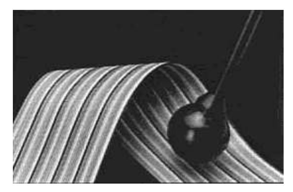
Omni-directional Ball Probe identifies E-Field signals over a broad frequency range.

The 7405 E & H Near Field Probe Set consists of three loop probes, one stub and one ball probe, an extension handle, an optional battery-powered preamplifier, and a foam-lined carrying case with a manual and application note. The handle of each probe terminates in a BNC connector. Probes are designed to be used with a signal analyzing device such as an oscilloscope or spectrum analyzer. The optional preamplifier is useful when signal amplification is necessary for the analyzing device.