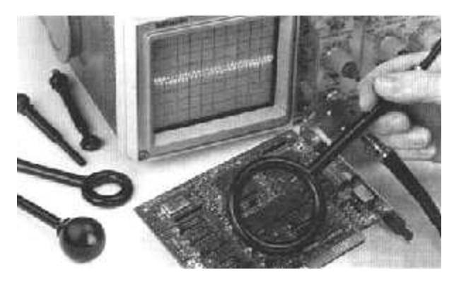
Loop probes offer varying sensitivities to H-Field emissions.