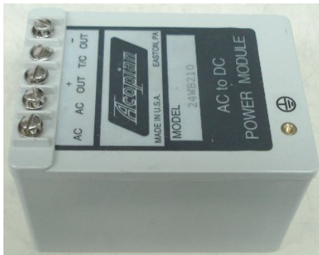
Figure 1: Acopian 24WB210.

The Acopian 24WB210 - 24VDC Mini encapsulated switching regulated power supply (see Figure 1) was shielded using adhesive metallic tape (see Figure 2).