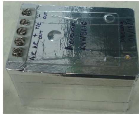
Figure 2: Shielded Acopian 24WB210.

Figures 3 and 4 show the results before (bands 13-17, 14 Apr 2011) and after the box reinforcement and power supply shielding.