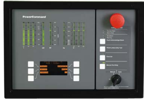
PowerCommand Operator Panel, including graphical display and analog AC metering.