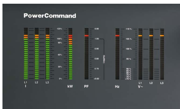
PowerCommand Analog AC Metering Display

The operator panel can be configured to require an access code prior to adjusting these values. A second access code is used to protect the control from unauthorized service level adjustments. Voltage and frequency adjustments are disabled during operation in parallel with a system bus to prevent inadvertent misadjustment of the paralleling load sharing functions.